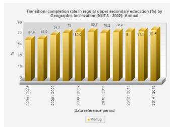
Figure 2. Year transition rates in the Portuguese secondary school; note the marked growth starting from the academic year 2005/2006, since the new curricula were introduced